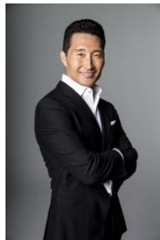
Daniel Dae Kim